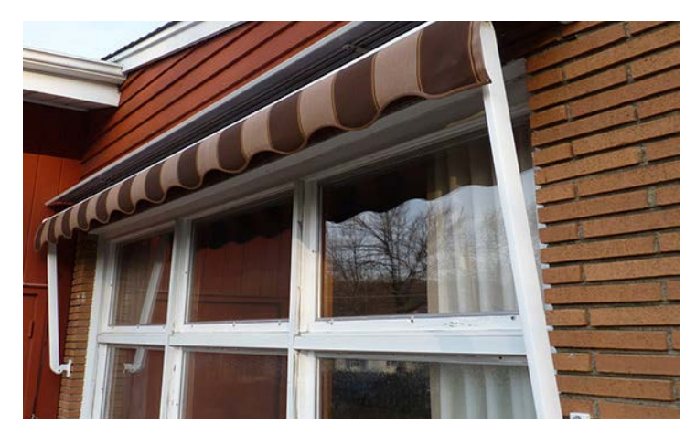
When completely rolled up, Capri rests discretely above your window.