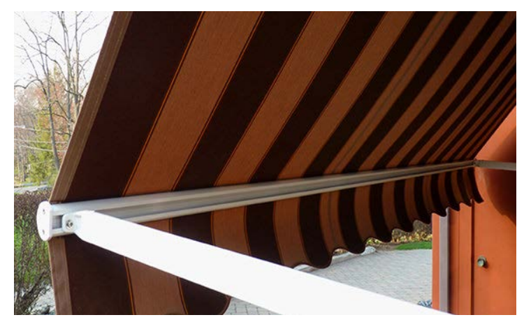
When rolled out, its spring-loaded arms conveniently reach any desired position in a matter of seconds.